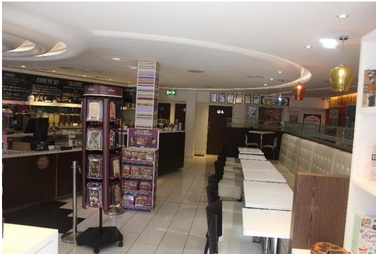
Above: The toilets viewed from the café