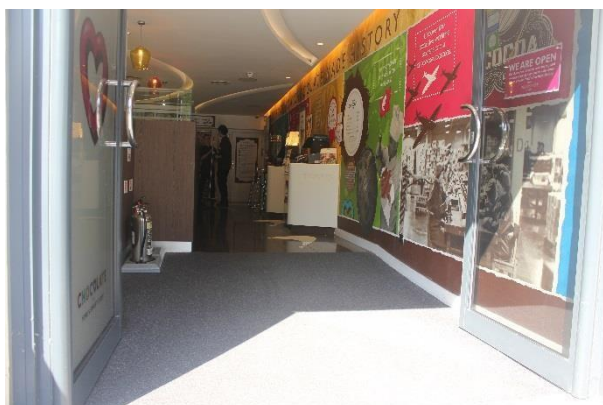
Above: Attraction entrance and small slope