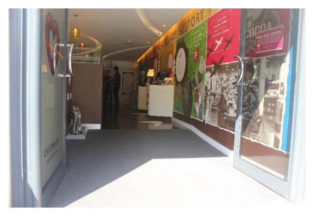
Above: Attraction entrance and small slope Right: Attraction entrance corridor

The clear door opening width is 74.5 inches (188cm). The entrance corridor is relatively narrow, 46 inches (116cm) at its smallest point.