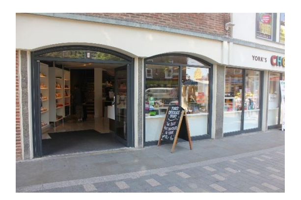
Above: Café and shop entrance doors from King's Square Left: Café seating and moveable tables

The shop and café contain a range of dairy free and gluten free options. However, due to the variety of ingredients we use, we cannot guarantee that our products are 100% free from a particular allergen, even though it may not contain that allergen/allergens as a deliberate ingredient.