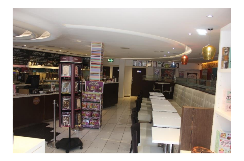
Above: The toilets viewed from the café