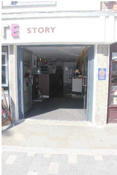
Below: York's Chocolate Story Entrance