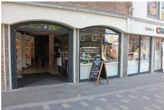
Above: Café and shop entrance doors from King's Square Left: Café seating and moveable tables

The shop and café contain a range of dairy free and gluten free options. However, due to the variety of ingredients we use, we cannot guarantee that our products are 100% free from a particular allergen, even though it may not contain that allergen/allergens as a deliberate ingredient.